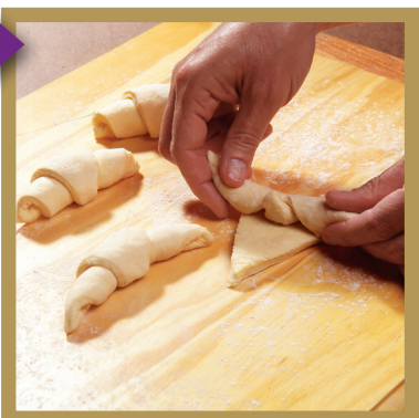
Chocolate Almond Twist